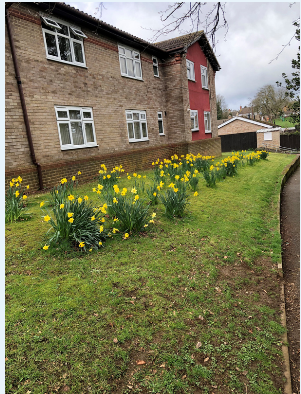
Still there and looking fabulous, April 2023