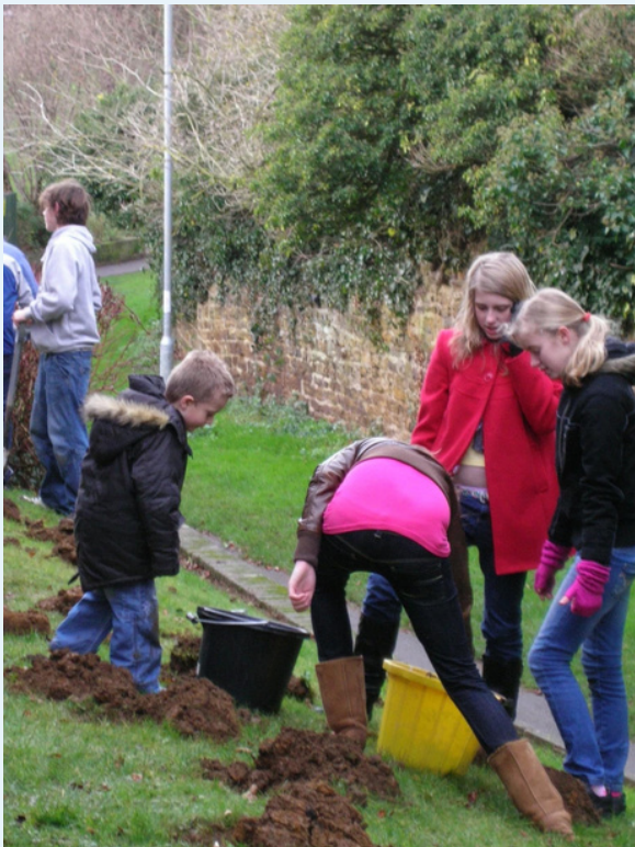
Broughton 4 Youth – Oct 2010

Every single bulb has been planted by volunteers and very many of these by young people as they were when this scheme started, some of whom are now enjoying them with their own children. Latterly, the Parish Council and friends have picked up on the planting. Very regrettably Operation Springbloom was cancelled last year by North Northants Council but we will lobby whenever we are able to see if we can have it re-instated.